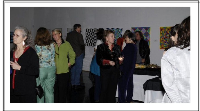
Enjoying the Portfolio Opening at the Courthouse Galleries.

Two boys found themselves in a modern art gallery by accident.