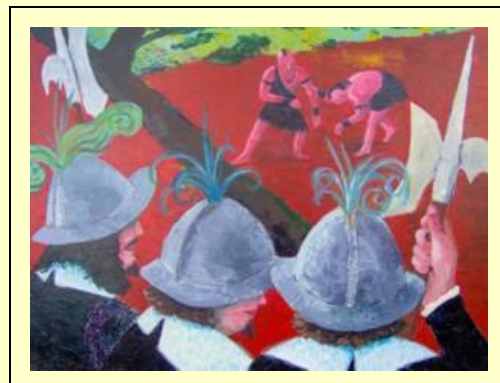
"Gauguin's Dream: The Explorers"