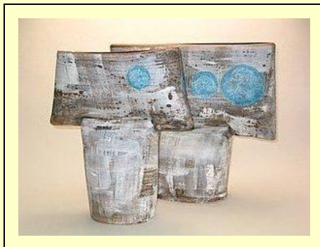
"Blue Moon Series"