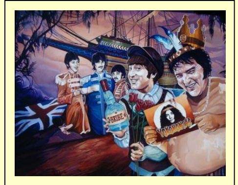
"Another British Invasion"