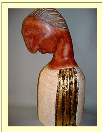
"Lady Rebecca Rolf alias Pocahontas Protector of Peace"