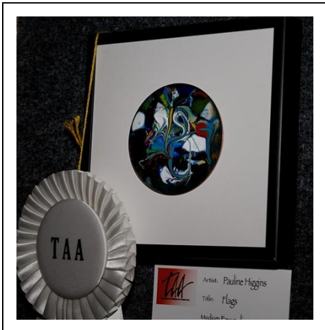
"Flags" by Pauline Higgins, Enamel on copper