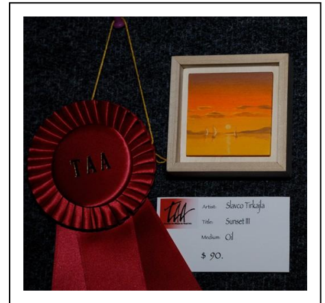
"Sunset 3" by Slavco Tirkajla, Oil