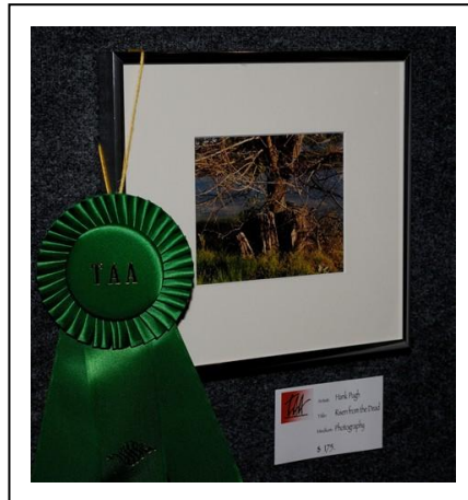
"Risen from the Dead" by Hank Pugh, Photograph