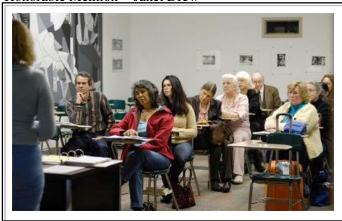
TAA members working hard at the November meeting in the TCC Visual Arts Center. Please join us Jan 13 for our next regular TAA meeting!