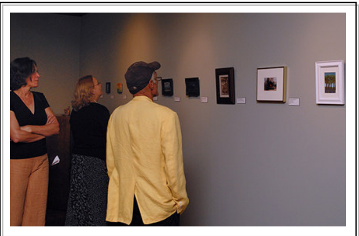
Enjoying the miniature show